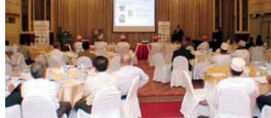
Distribution Automation Presentation in progress.