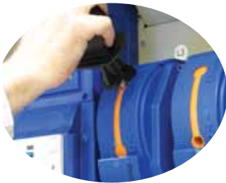
Retractable disconnecter handle used to switch the unit.