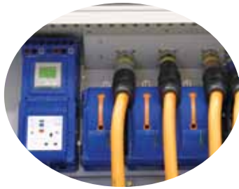
Standby generator cables fitted to the Veam Powerlock sockets. The earth socket is mounted at the bottom of cabinet.