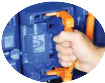
Fully shrouded AcuLok handle easily extracted from the fuse way