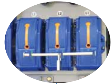
Transformer disconnectors padlocked off with the link bars in place.